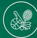
MULTI SPORT PLAY AREA