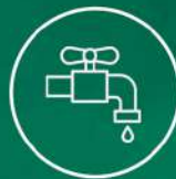
PIPED WATER SUPPLY