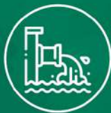
STORM WATER DRAIN